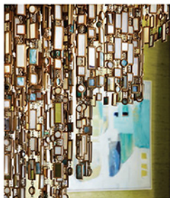
Corbett Lighting corbettlighting.com