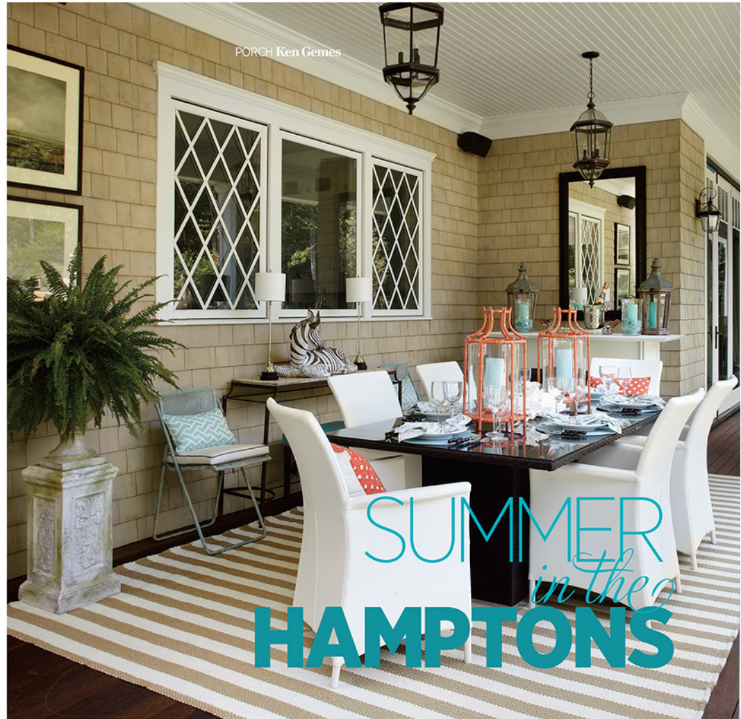
PORCH Ken Gemes

30+ DESIGNERS SHOWCASE SEASIDE STYLE IN THE EXPANSIVE INTERIORS (PLUS THREE PORCHES AND TWO POOL AREAS) OF THE HAMPTON DESIGNER SHOWHOUSE