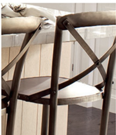
Ballard Designs ballarddesigns.com