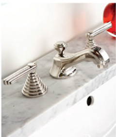
P.E. Guerin peguerin.com