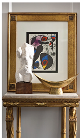
Entry foyer "It showcases classic design elements and a unique flair for meaningful art," Michael Herold says of the eclectically curated two-story foyer. Benjamin Moore's "Cloud Cover" paint pops against the dark-stained wood floors. Iconic Pedro Friedberg hand chairs add whimsy. A geometric pattern from Stanton Carpet covers the stairs.