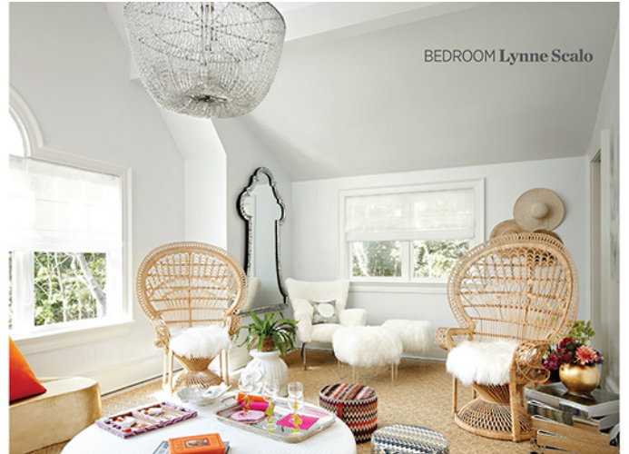
BEDROOM Lynne Scalo