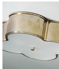
Circa Lighting circalighting.com