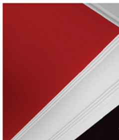
Benjamin Moore benjaminmoore.com