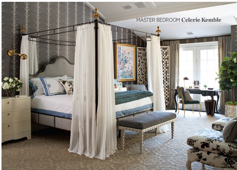
MASTER BEDROOM Celerie Kemble

Master bedroom Celerie Kemble's master bedroom serves as a "sophisticated, year-round retreat from city life." The foliage-inspired wallcovering plays well with the room's fabrics, including the draperies' pinstriped linen and the desk chair's Prussian blue velvet. Sheer draperies on the Horredon upholstered bed enhance the airy atmosphere. Maitland-Smith provided the shell-inlay folding screen, wastebasket, and brass desk lamp. The octagonal sitting room's sofas, armchairs, and petal cocktail table are also by Horredon. Hudson Valley Lighting's aged-brass lantern punctuates the teal ceiling.