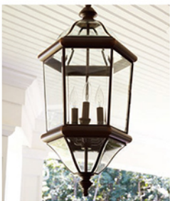
Hinkley Lighting hinkleylighting.com