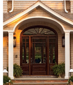
Bodenchak Design & Build 917/968-9020