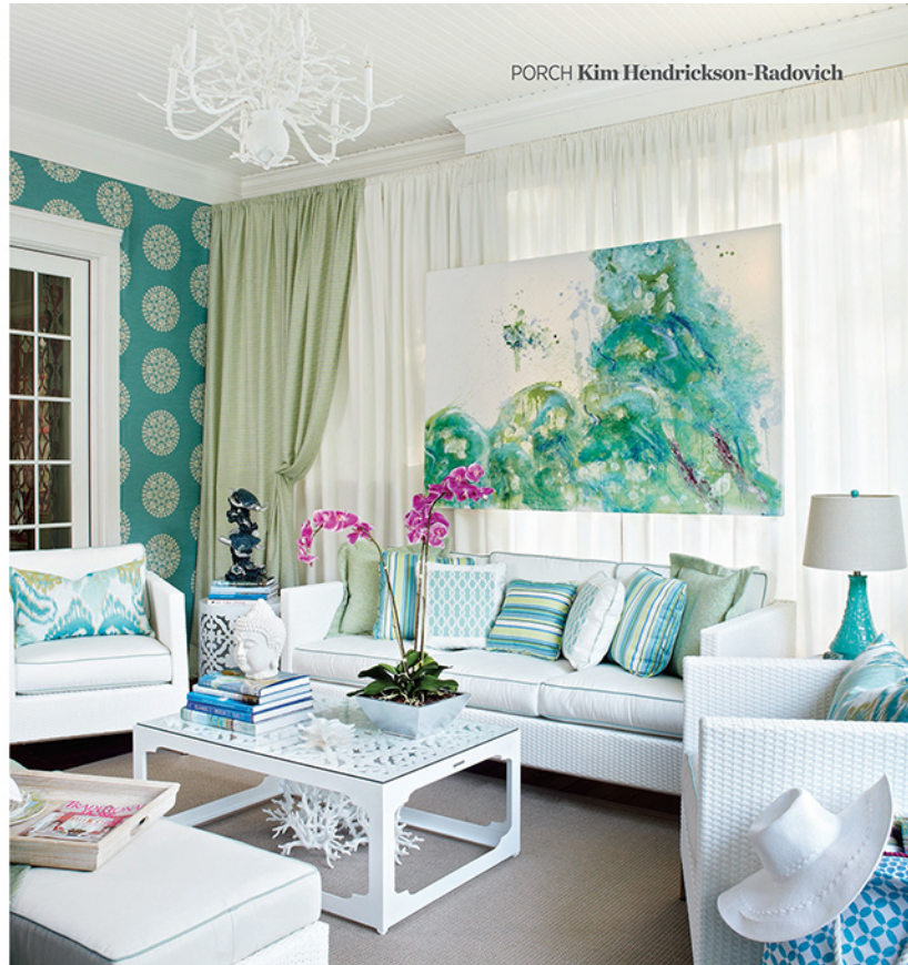
PORCH Kim Hendrickson-Radovich

Porch Designer Kim Hendrickson-Radovich intended this posh outdoor space to function as a "summertime family room," complete with plenty of seating with poolside views, a cool-blue palette, and lots of pattern. A bright white paint by Benjamin Moore coats the moldings and tongue-and-groove beadboard ceiling. The innovative window treatment with removable walls and layered draperies gives the porch an indoor feel. All the outdoor furniture, including the white wicker sofa, matching lounge chairs, and laser-cut side table, is from Frontgate. The sisal area rug is from Stanton Carpet.