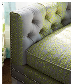
Lillian August lillianaugust.com