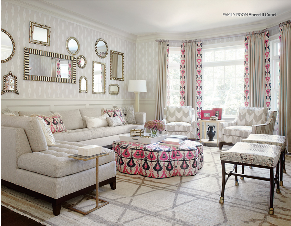
FAMILY ROOM Sherrill Canet