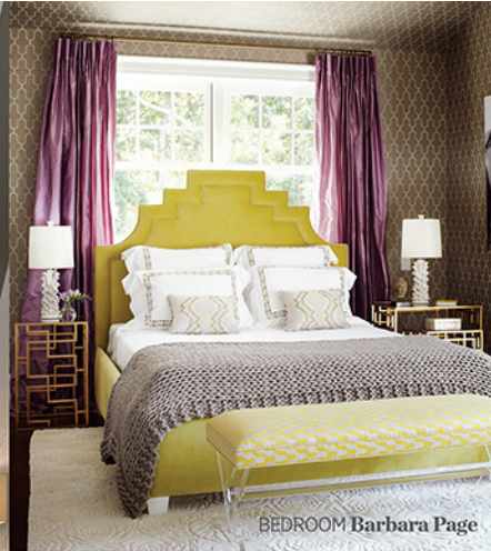
BEDROOM Barbara Page