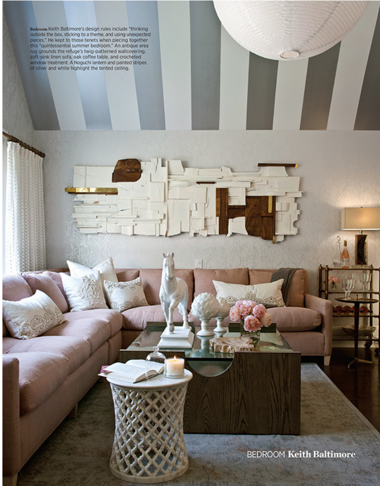
BEDROOM Keith Baltimore

Bedroom Keith Baltimore's design rules include "thinking outside the box, sticking to a theme, and using unexpected pieces." He kept to those tenets when piecing together this "quintessential summer bedroom." An antique area rug grounds the refuge's twig-patterned wallcovering, soft-pink linen sofa, oak coffee table, and crocheted window treatment. A Noguchi lantern and painted stripes of silver and white highlight the tented ceiling.