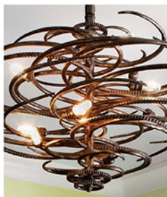
Troy Lighting troy-lighting.com