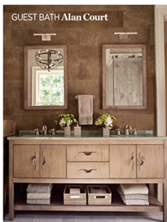
GUEST BATH Alan Court

Guest bath Natural textures and neutral tones underscore this tranquil retreat designed by Alan Court. Recycled leather tiles form a unique wallcovering, which is offset by molding trim painted in Benjamin Moore's "Morning Dew." A crushed-glass countertop and pewter hardware dress the driftwood vanity. The mirrors with wall-mounted lights reflect a lovely bronze orb pendant.