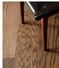
Shaw Floors shawfloors.com