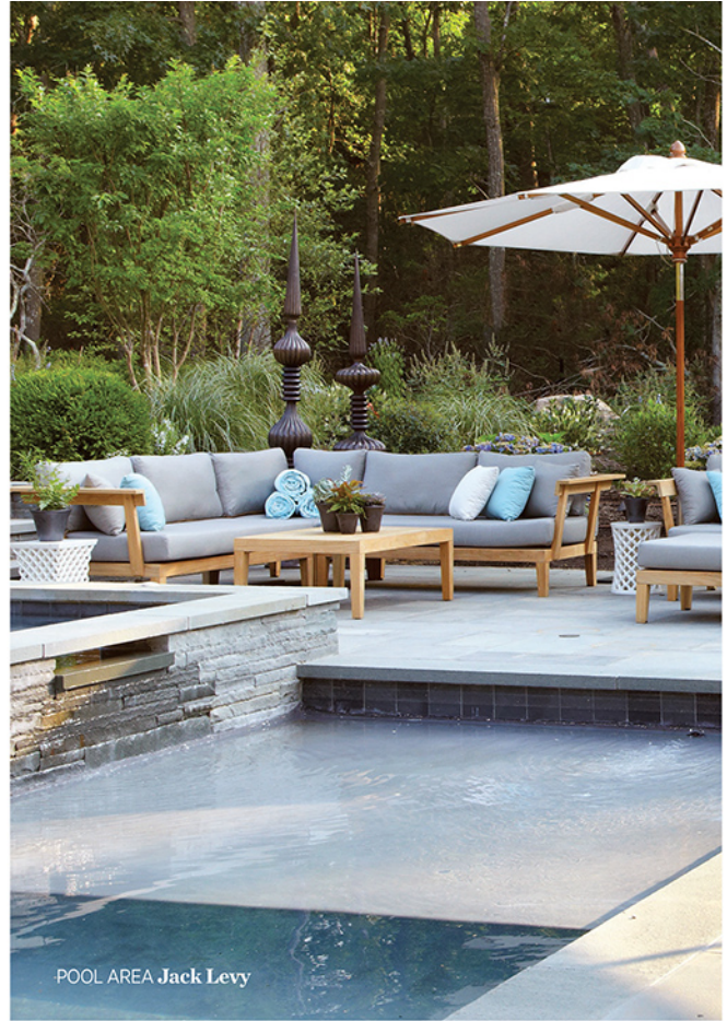
POOL AREA Jack Levy