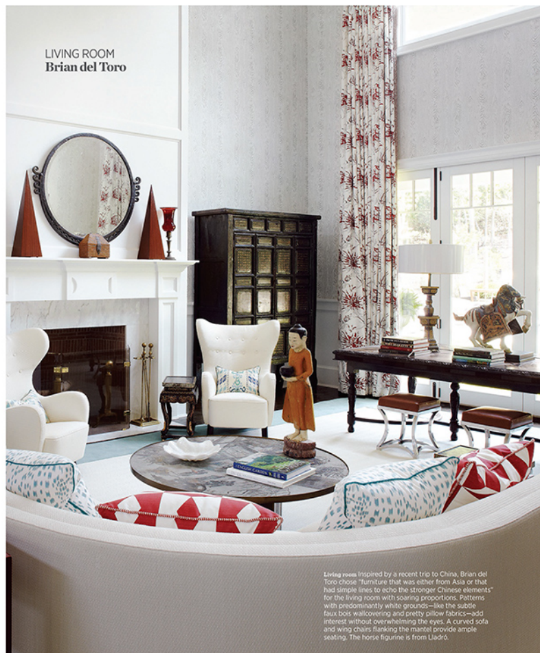
LIVING ROOM Brian del Toro