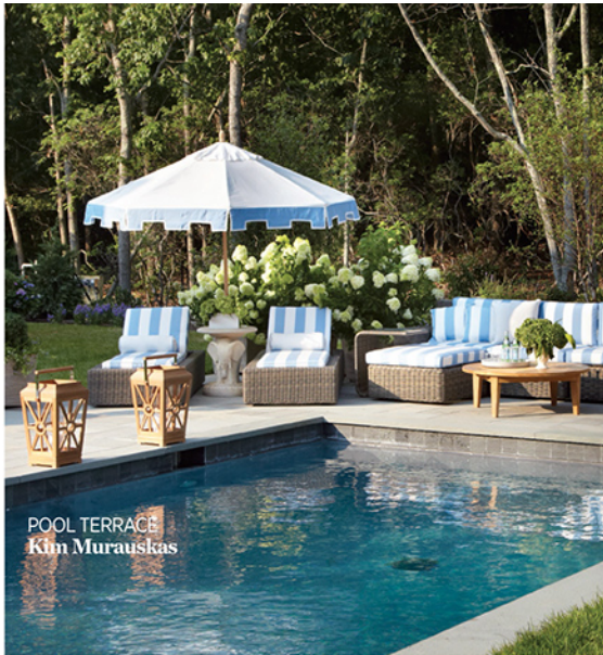
POOL TERRACE Kim Murauskas

Pool terrace The other end of the pool showcases wicker furniture with striped cushions from Frontgate. An elephant umbrella table with a cerulean canopy offers stylish shade. Large teak lanterns illuminate the area, encouraging evening swims and late-night lingering.