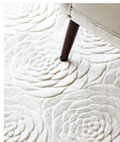
The Rug Company therugcompany.com