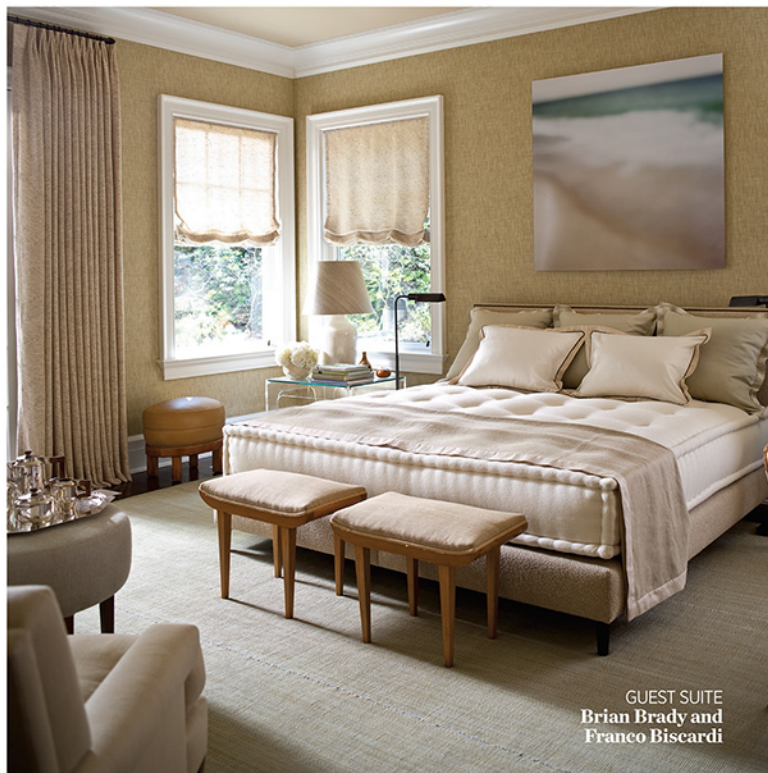
GUEST SUITE Brian Brady and Franco Biscardi

Guest suite It's safe to say Brian Brady and Franco Biscardi aren't afraid of texture. From the grass cloth wallcovering and wool-and-linen rug to the baby alpaca upholstery on the button-tufted bed mattress, the guest bedroom is awash in natural fibers. An earthy color scheme of moss green and sand tones is reflective of the room's surrounding woods and lawn. The adjustable bronze floor lamps are courtesy of Circa Lighting.