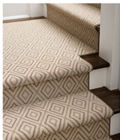
Stanton Carpet stantoncarpet.com