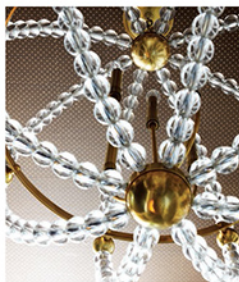
Hudson Valley Lighting hudsonvalleylighting.com